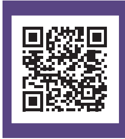
Watch this video for installation.